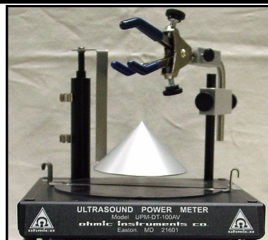
The cone target and transducer positioner. Tank not shown