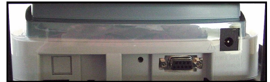
Rear view: RS-232 and printer ports. CE approved (above)