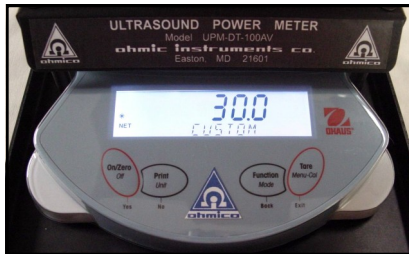
Front Display Panel